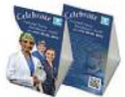
Table tent advertising in the GAPNA Networking Areas within the meeting space and exhibit hall provides great exposure in busy gathering areas seen by hundreds of attendees each day.