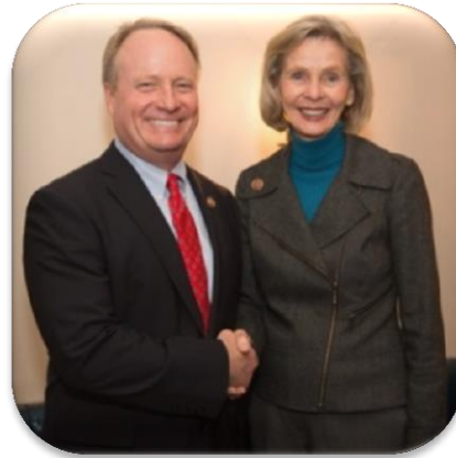
House Nursing Caucus Co-Chairs, Representatives David Joyce and Lois Capps.